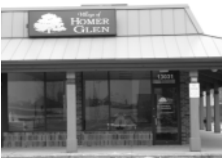
The Village of Homer Glen's Council Chambers at 13031 W. 143rd Street.