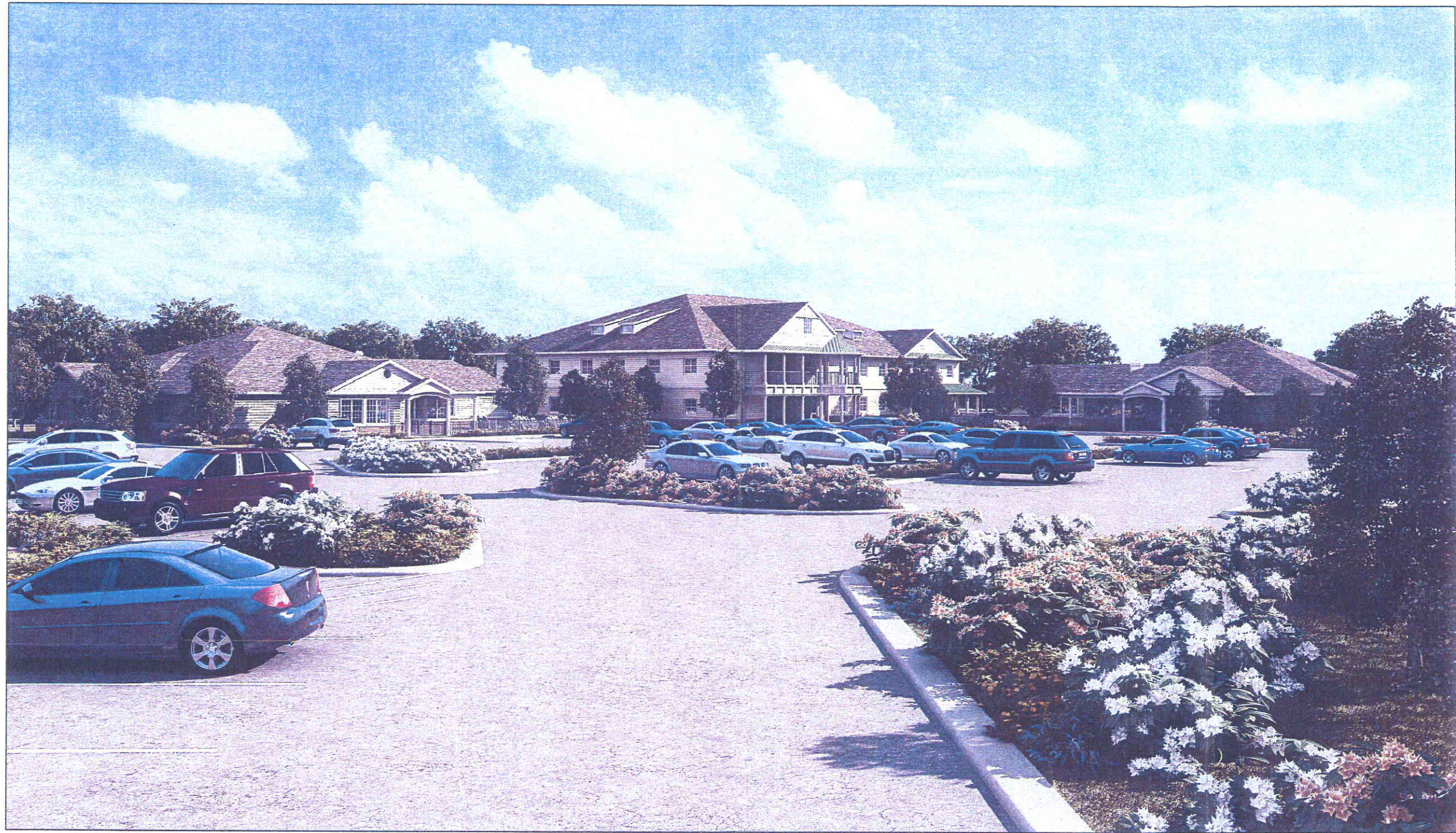
VIEW OF PROPOSED DEVELOPMENT