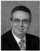
Russ Petrizzo, Mayor