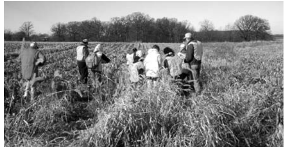
Volunteers are "ground truthing", or verifying, current environmental data.

Residents or other stakeholders interested in becoming involved in this project should contact the Village Office at 1-708-301-0632. Please leave your name and telephone number and a task force member will contact you.